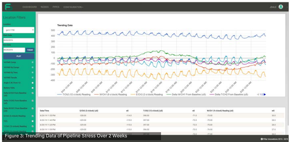
Figure 3: Trending Data of Pipeline Stress Over 2 Weeks

Figure 3 shows trending information captured by the system over a 27-day period. Utilizing this system, the customer made safe, informed decisions regarding the manipulation of pipeline prior to backfill.